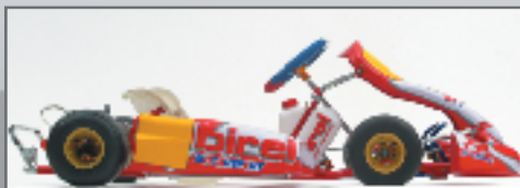
The AR28Z is available with Birel factory graphics kit (shown above).

The "X" system allows the AR28Z chassis to have three different wheelbase settings for varying track conditions, tire compounds or driver preference. In addition, there are two ride-height settings, giving the AR28Z more adjustment capabilities than any other kart in its class.