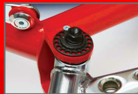
The all-new eccentrics allow a very large range of adjustments for caster/camber.