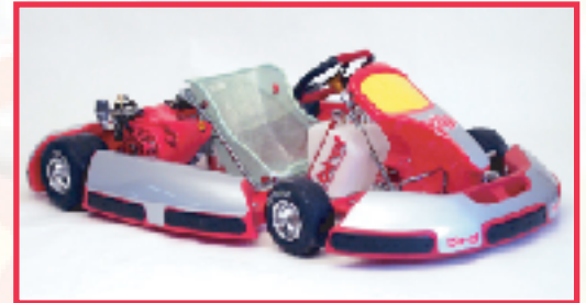
Our karts are built with safety and durability in mind to make your charity event a winner!