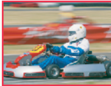
Racing Kart in action!