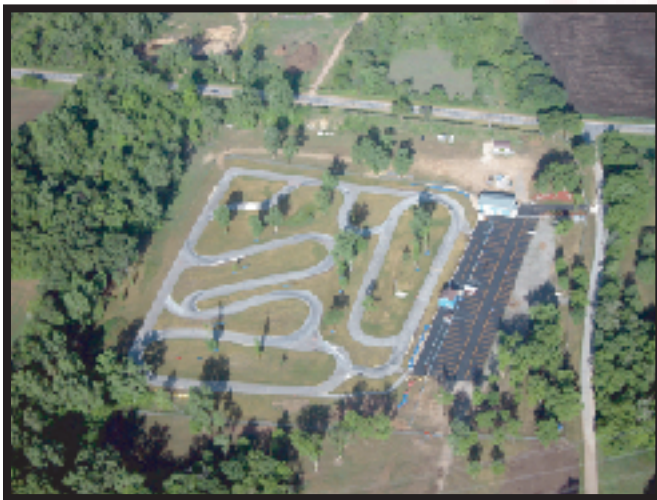
Aerial view of MRP of South Bend