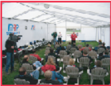
A charity group has all media & press conference opportunities.